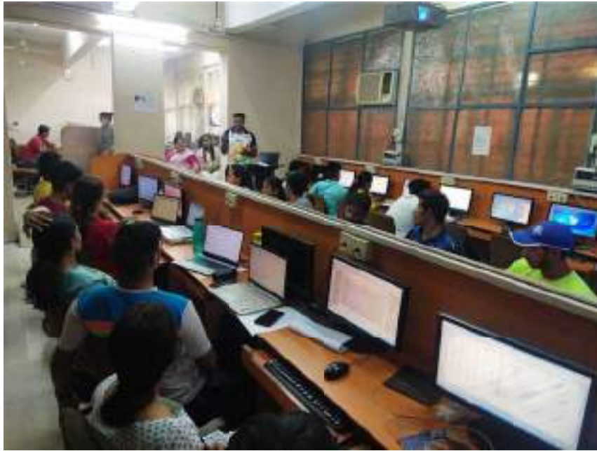
Summarization by Mr. Kapil M.P.Ed Sem-III

On the 3 rd day of the workshop, the resource person focused on Creating SPSS Data set with Proper Definition and Parameter defining of each variable, Computation of Descriptive Analysis, and Saving Descriptive Results in Word File along with Command, and Execution of the Split Files. The session also included the student teacher interaction.