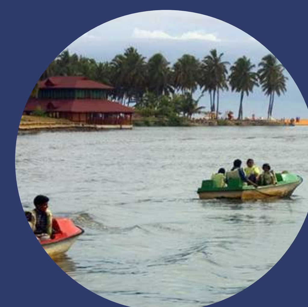
Veli Tourist Village

Note: Sightseeing facility will be provided to the Conference Delegates on one day of the Conference