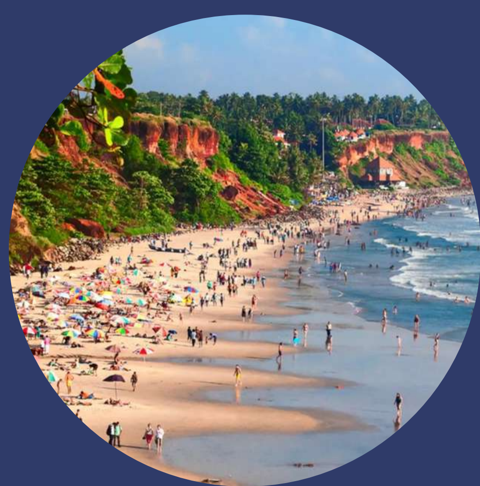
Varkala Beach & Cliff

Thiruvananthapuram is the capital city of Kerala - God's own country. Lakshmi Bai National College of Physical Education, the Conference venue is located at a distance of 14 Kms from the Thiruvananthapuram International Airport (TRV). The nearest Railway Station is Kazhakuttam within a distance of 4 Kms. Major tourist attractions in and near Thiruvananthapuram include: