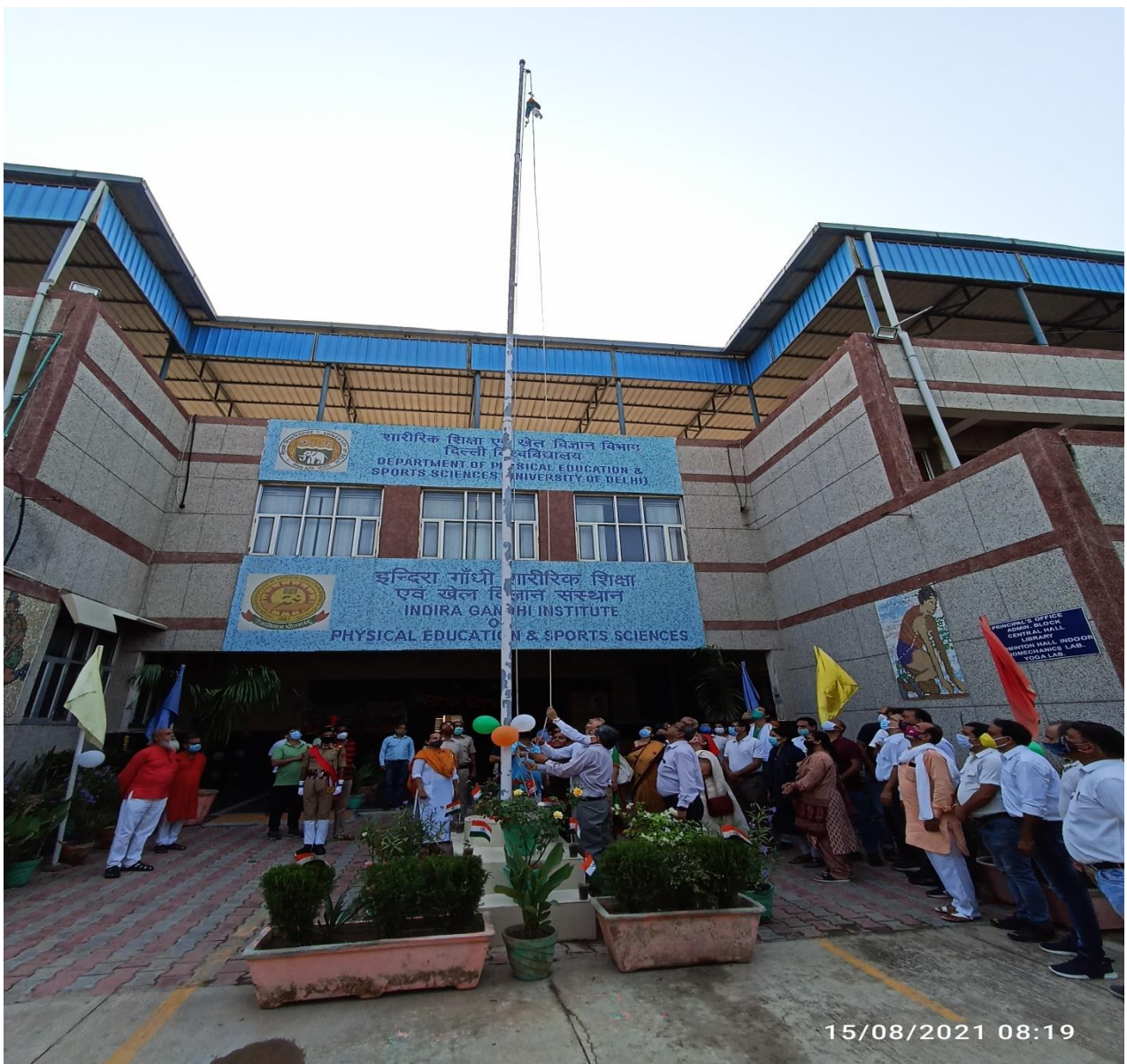
75 th Independence Day Celebration