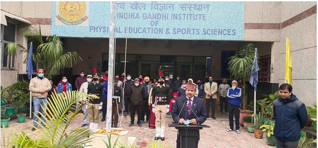
73 rd Republic Day Celebration