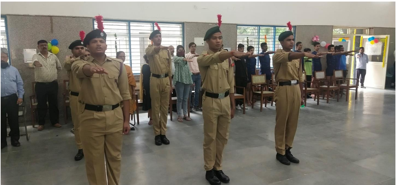
Pledge Swatchh Bharat Abhiyan