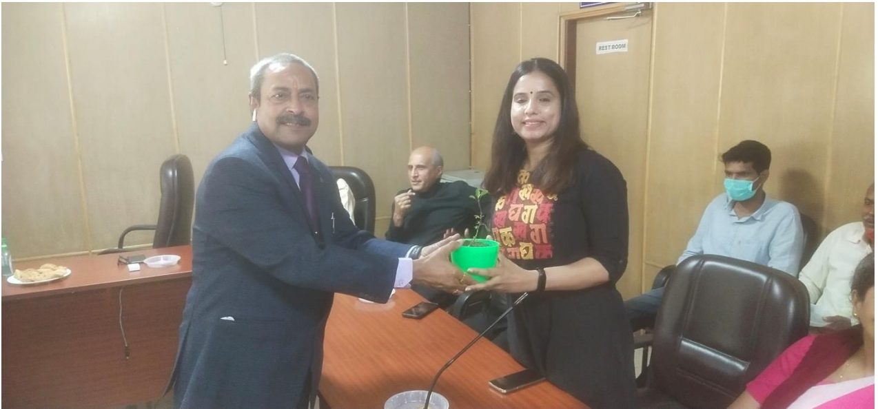
International Women's Day Celebration