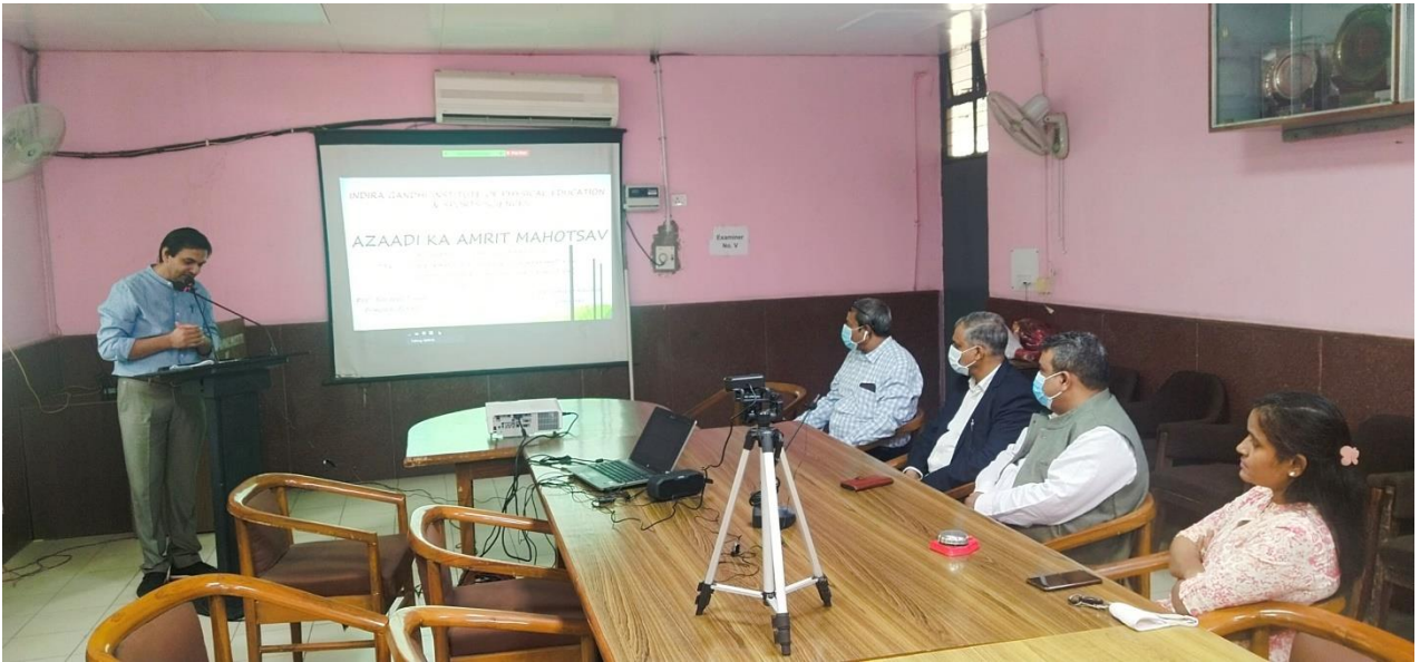
Azadi ka Amrit Mahautsav