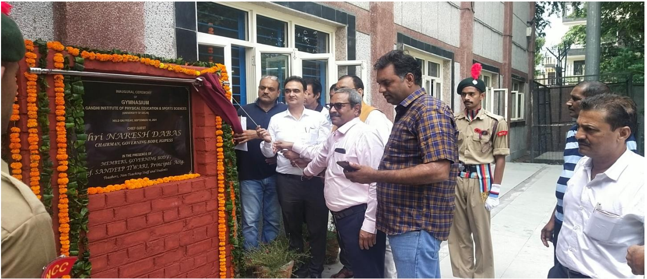
Inauguration New Gymnasium Hall