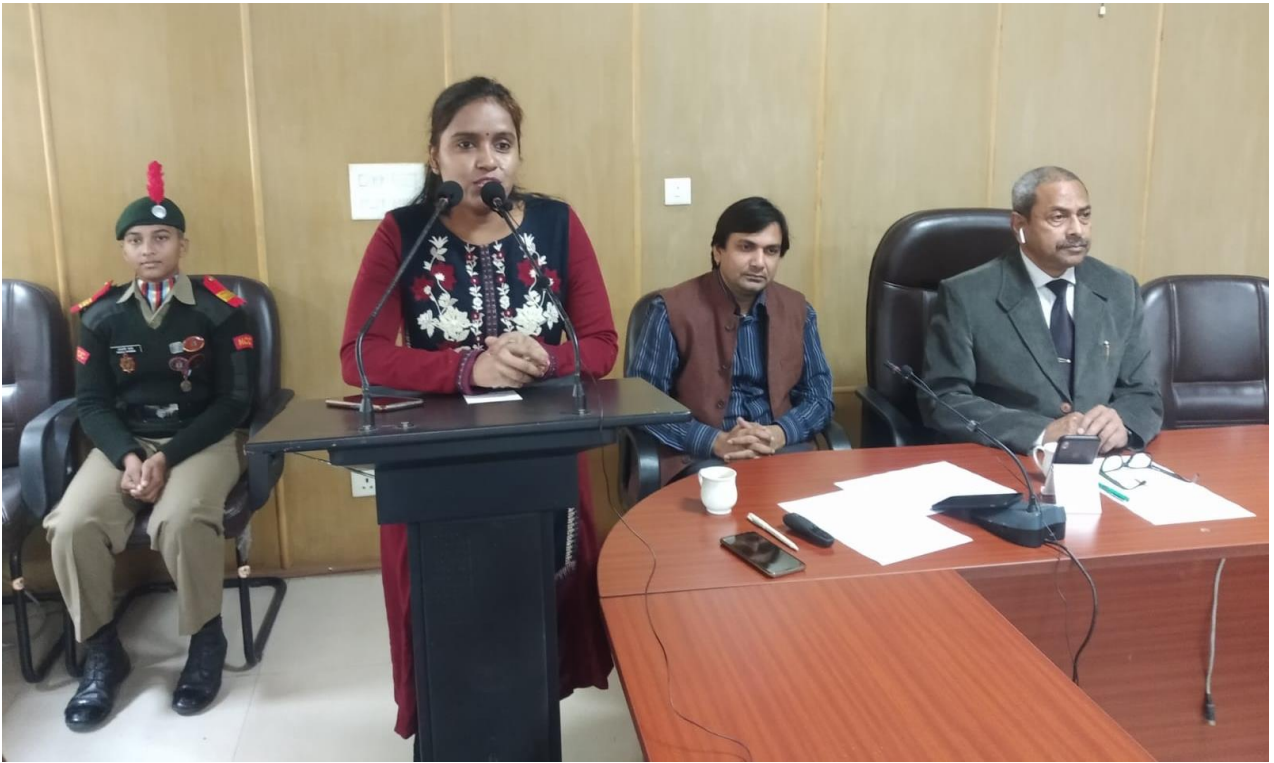
Competition on Speech on SWACHHATA