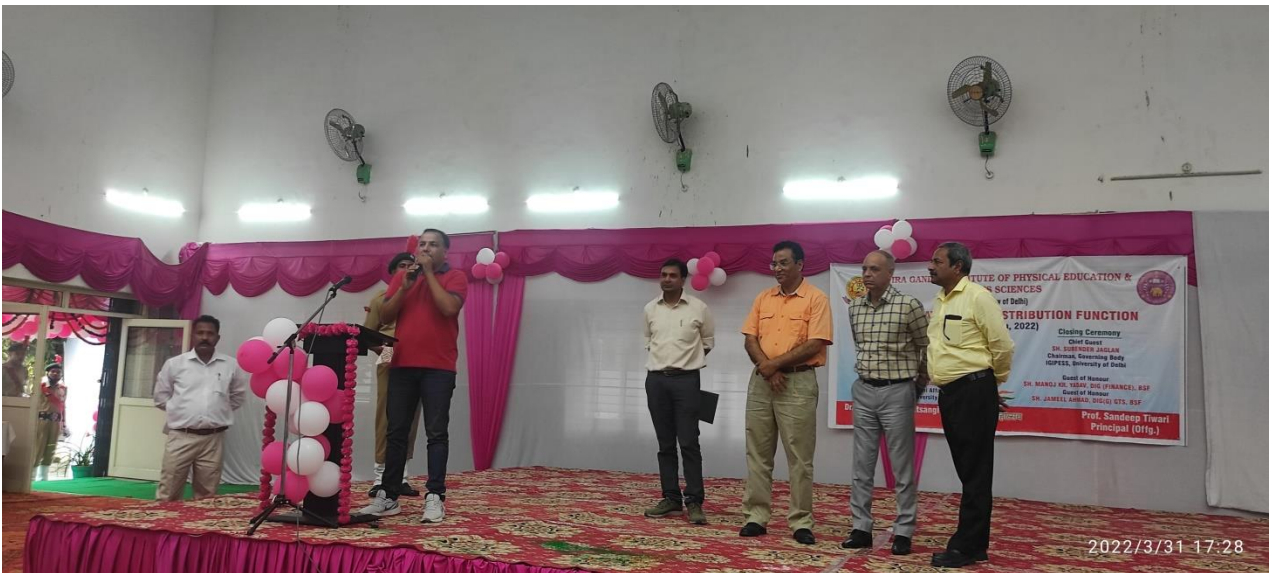
Annual Day Celebration 2021-22