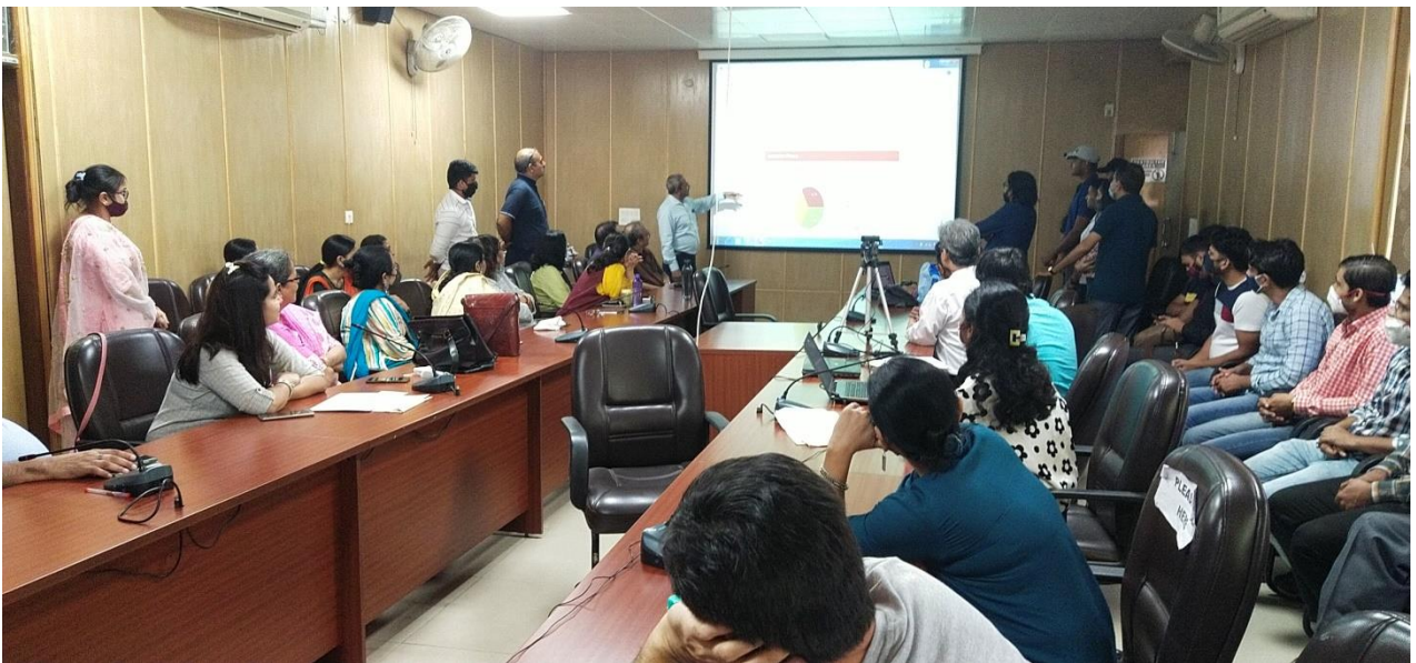
Alumni Data Bank