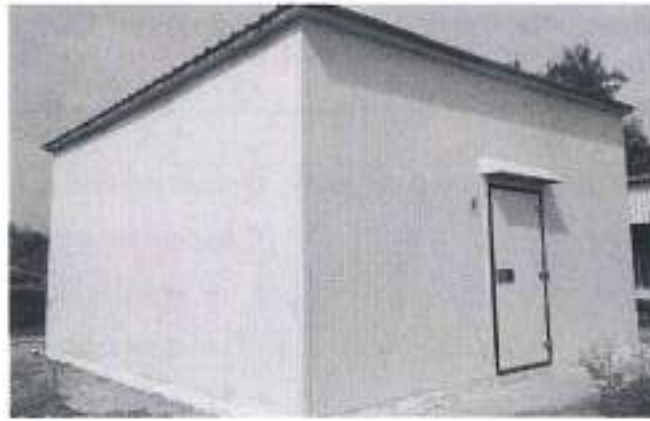
Fig. 5. Controlled storage structure