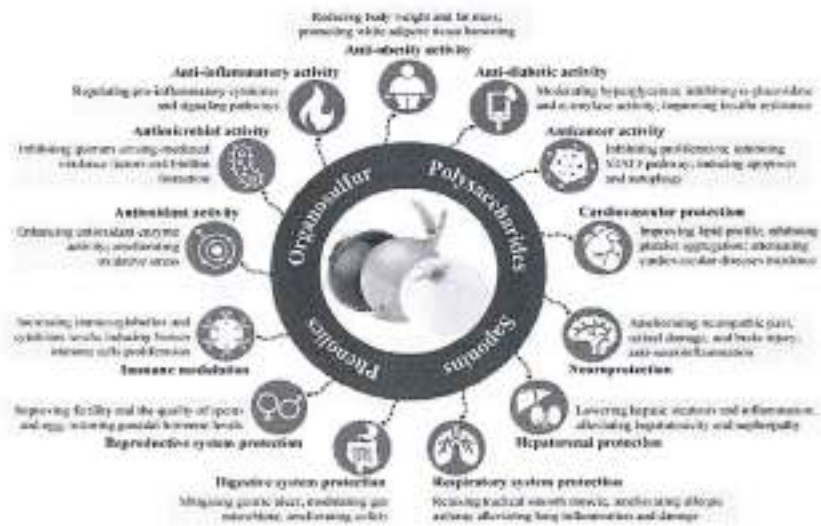
Fig. 2. Health benefits of onions