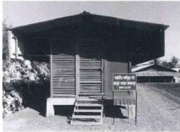
Fig. 4. High volume structure

These current prevailing structures that may vary in their capacity as well as the cost to fulfil the requirements of all income groups of farmers/traders. Though these naturally ventilated storage structures are well adopted, still considerable losses occur as there is no control of temperature, relative humidity and airflow which are very important for successful storage of onion with minimum losses. The construction of the 50 MT double row modified bottom and side ventilated storage structure needs approximately Rs. 7 lakhs.