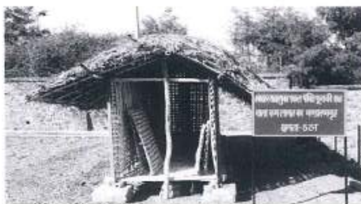
Fig. 3. Low volume structure