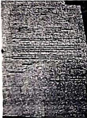
MHRD Higher Education.jpg 104K