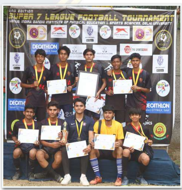
2nd Runner Up