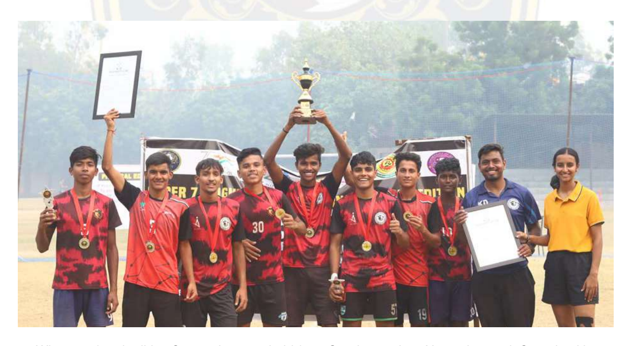
Winners of 2nd edition Super7 League, held from October 30th to November 2nd, Organised by Indira Gandhi Institute of Physical Education and Sports Science, University of Delhi, B-Block, Vikaspuri, New Delhi, 110018

One of the objectives of the event is to provide a platform for schools and football clubs of Delhi to show their skills and talent in a healthy and competitive environment at the grass-root level, and to promote active sports participation among the youth. We are trying to create unique and premium sporting events focused on providing the best experience to the players, coaches, and spectators. Our event will portray true love and passion for sports.