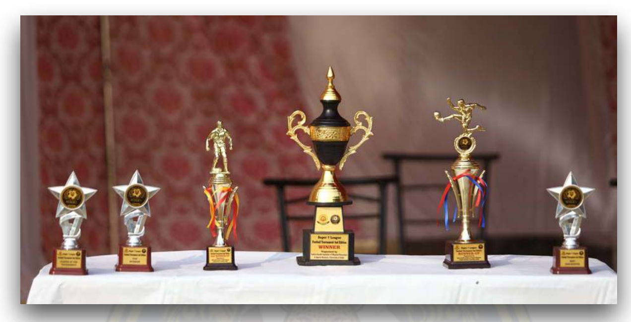
Trophies and mementoes of 2nd Edition

The Super 7 League acts as a starting point in the development of players by providing playing opportunities in the