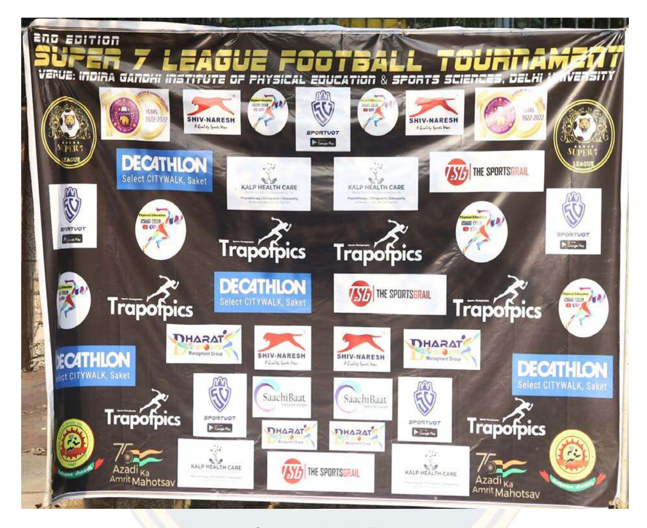
Sponsors of 2nd edition