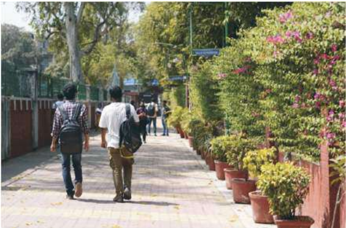
University of Delhi

Admission to School of Open Learning (SOL) and NCWEB will be based on Class XII marks. Candidates must register themselves on www.admission.uod.ac.in